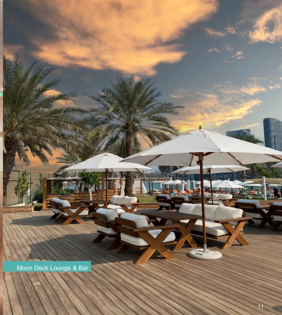
Moon Deck Lounge & Bar