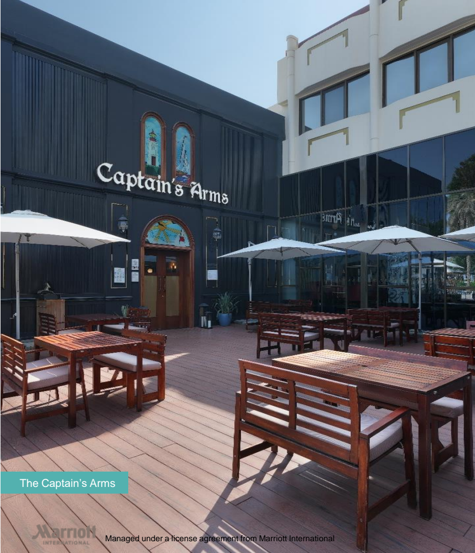
The Captain's Arms