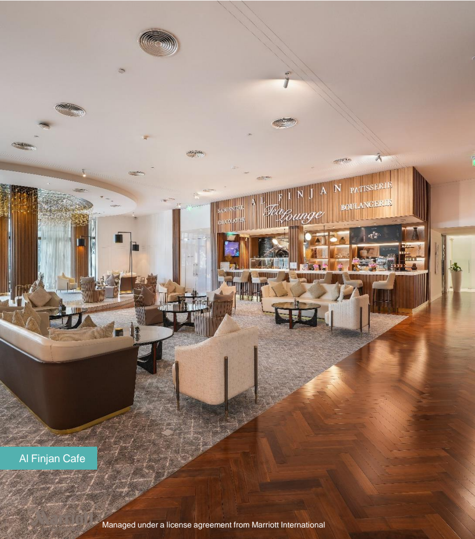
Al Finjan Cafe